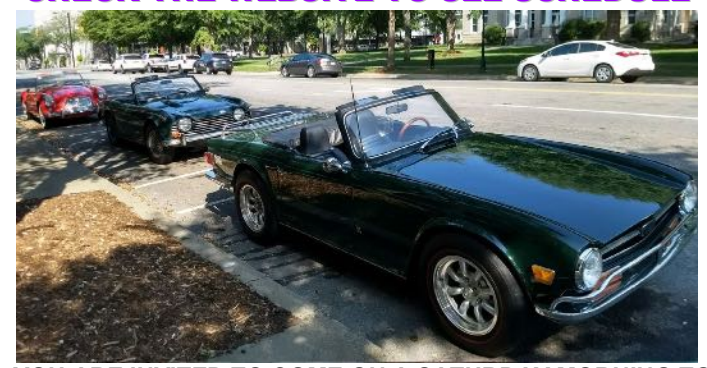
YOU ARE INVITED TO COME ON A SATURDAY MORNING TO