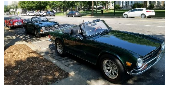
YOU ARE INVITED TO COME ON A SATURDAY MORNING TO