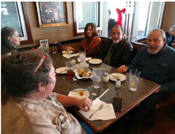
Try the Garlic Knots they are great