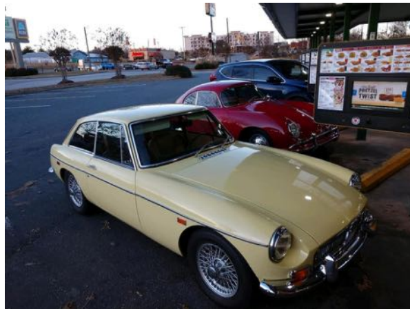
Final stop at Sonic for ice cream