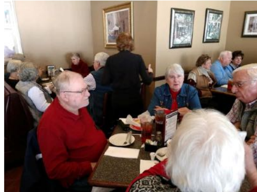
Meal at LaStrada Restaurant