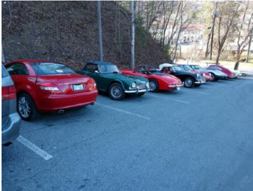
Stopping for lunch