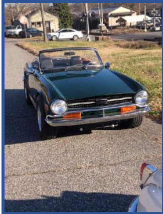
We had one red and one green car and the rest neutral colors