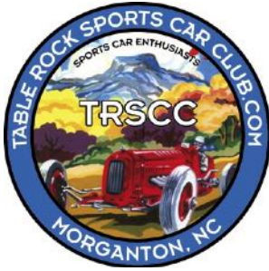
Table Rock Sports Car Club Shares their activities on FB as well at

https://www.facebook.com/TableRockSportsCarClub/