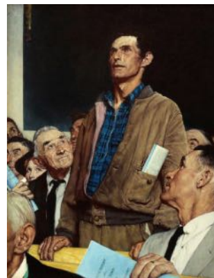
Freedom of Speech

As our nation was in the middle of World War II, Franklin D. Roosevelt gave a speech about preserving our freedoms from the Axis powers. Norman Rockwell designed four covers for the Saturday Evening Post that captures the four freedoms Roosevelt described. Take a few minutes and reflect on these freedoms and how they are part of your life each day.