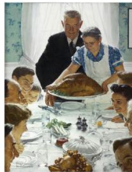
Freedom from Want