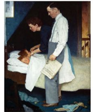
Freedom from Fear