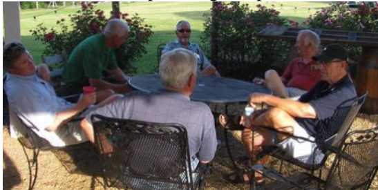
Discussing combustion ratios and other high tech issues.