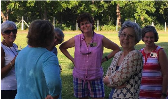
Ladies planning a trip to the Bahamas