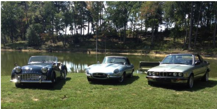
Evolution of design over two decades of sport cars.

Here some of the captions submitted for the pictures.