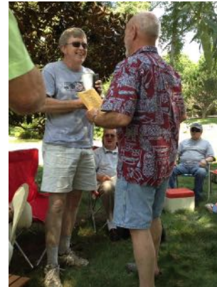
I can get you one of these Hawaiian shirts the next time I am there.