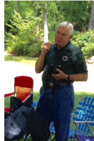
Do you know how hard it is to get twenty some people to look at me for a group picture?