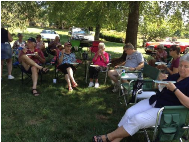
If anyone gets up, could you bring me Seconds Of everything?