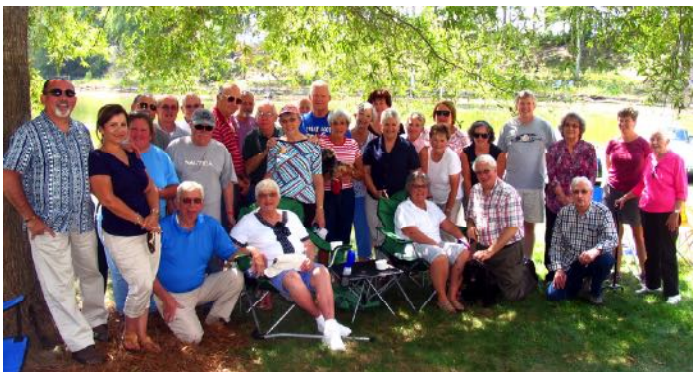
The Best Looking European Car Club in Cleveland County – voted by the Shelby Star.