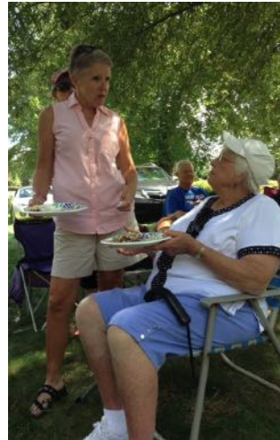
Will you share that recipe?