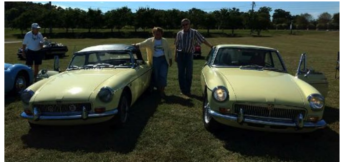
MG Soft Top and Hard Top