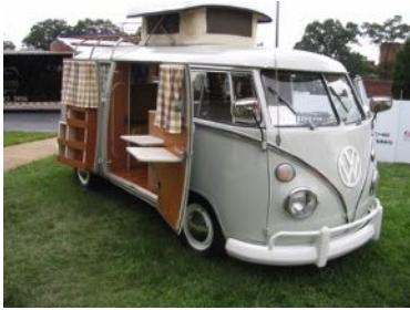
VW CAMPER BUS