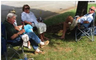
TABLE ROCK SPORTS CAR CLUB BAK IN ACTION – CHECK THEIR WEBSITE FOR EVENTS