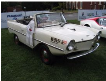
NEXT STOP LAKE HICKORY