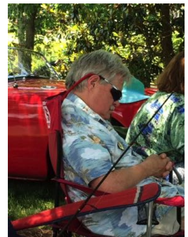
Caption: Pausing to reflect on the many activities during the day.