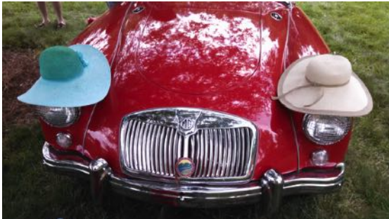
Caption: An MGA with three bonnets