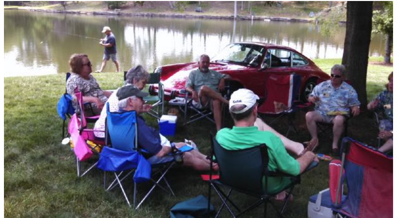
Caption "I've decided to throw my hat in the ring to run for President. What do you think?"