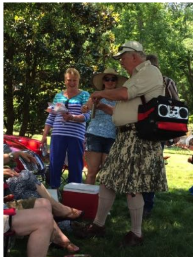
Caption: Mac sharing the advantages of Scottish flask over the boom box. It was a spirited debate.