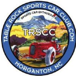
TABLE ROCK SPORTS CAR CLUB MAY FUN DRIVE WITH BROAD RIVER EUROPEAN MOTOR CLUB MEMBERS FROM MORGANTON TO FOREST CITY CORVETTES FOR VETS SHOW AT McNAIR FIELD

JUNE 13 FUN DRIVE CHECK THEIR WEBSITE AT WWW.TRSCC.COM